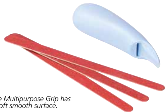
The Multipurpose Grip has a soft smooth surface.

Beauty Multipurpose grip rests securely in the whole hand and offers a variety of use. With a poor hand function it can be very difficult to use a nail file. By inserting a nail file into the narrow end, a pedicure can be done with ease. The wider end of the grip may be used for a tooth brush or shaver.