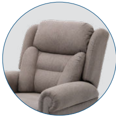
Lateral Support Backrest KA554-LS