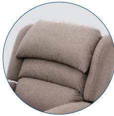
Standard Support Backrest KA554-SB