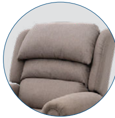
High Support Backrest KA554-TB